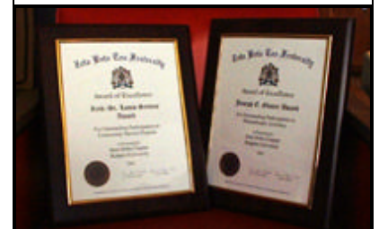
Latest awards presented to Beta Delta: Joseph E. Glazer Award and the Rich/St. Louis Service Award