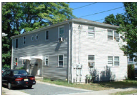
The new Chapter location— 45A Stone Street. This is the second year that the Beta Delta has been housed there.

As in years past, ZBT will be holding its annual BBQ at the Stadium lot. The event is free, though donations are encouraged. This time, we will be in the YELLOW LOT , not the traditional alumni area. Look for the ZBT flag and the 16E flag flying high, and there you will find us! Tickets will be purchased together during the BBQ. Families are welcome. We hope to see you there! ;